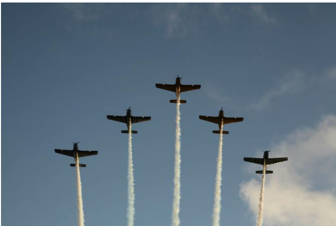
Red Star Pilot Team photo