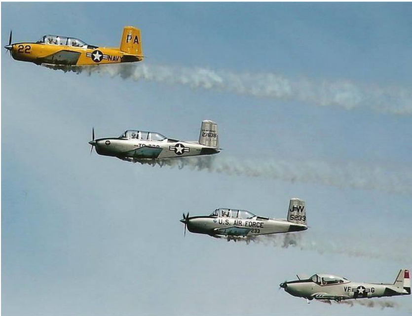
Hooligans Flight Team photo